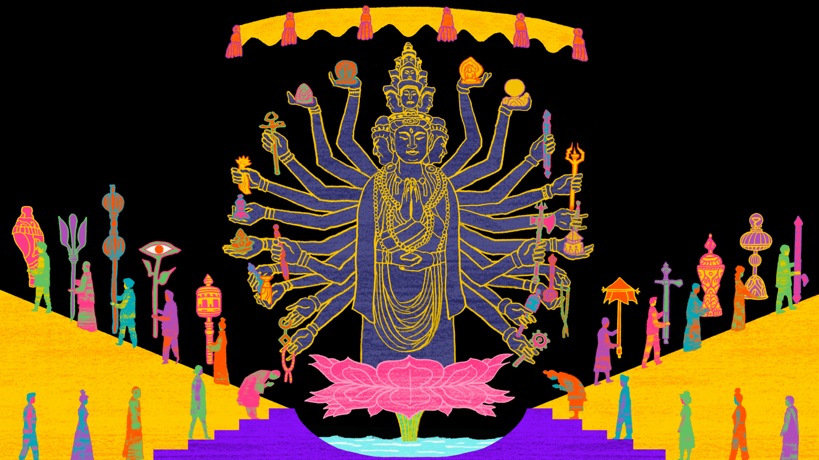
Illustration: Rob Sato © 2023